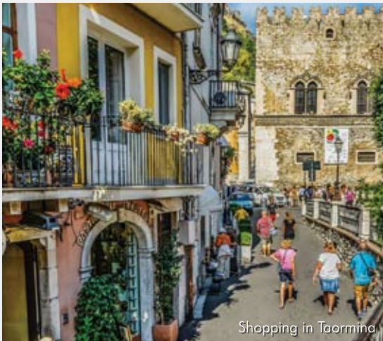
Shopping in Taormina