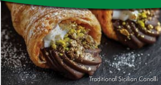
Traditional Sicilian Canoli