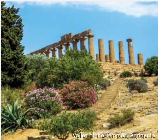
Valley of the Temples, Agrigento